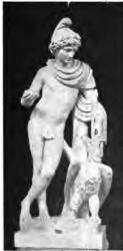
Fig. 8. Ganymede and the Eagle.

upon Ganymede when he was watching his flocks on Mt. Ida, and carried him off to Olympus to be his cup-bearer. This aroused Hera's anger, not only against her husband but against the whole race of Trojans, whom ever after she pursued with relentless hatred. Indeed all Zeus's favor-